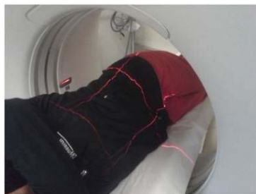
Good Looking Scout