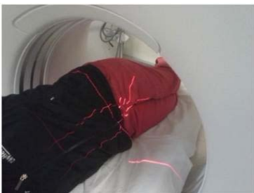
Bad Looking Scout